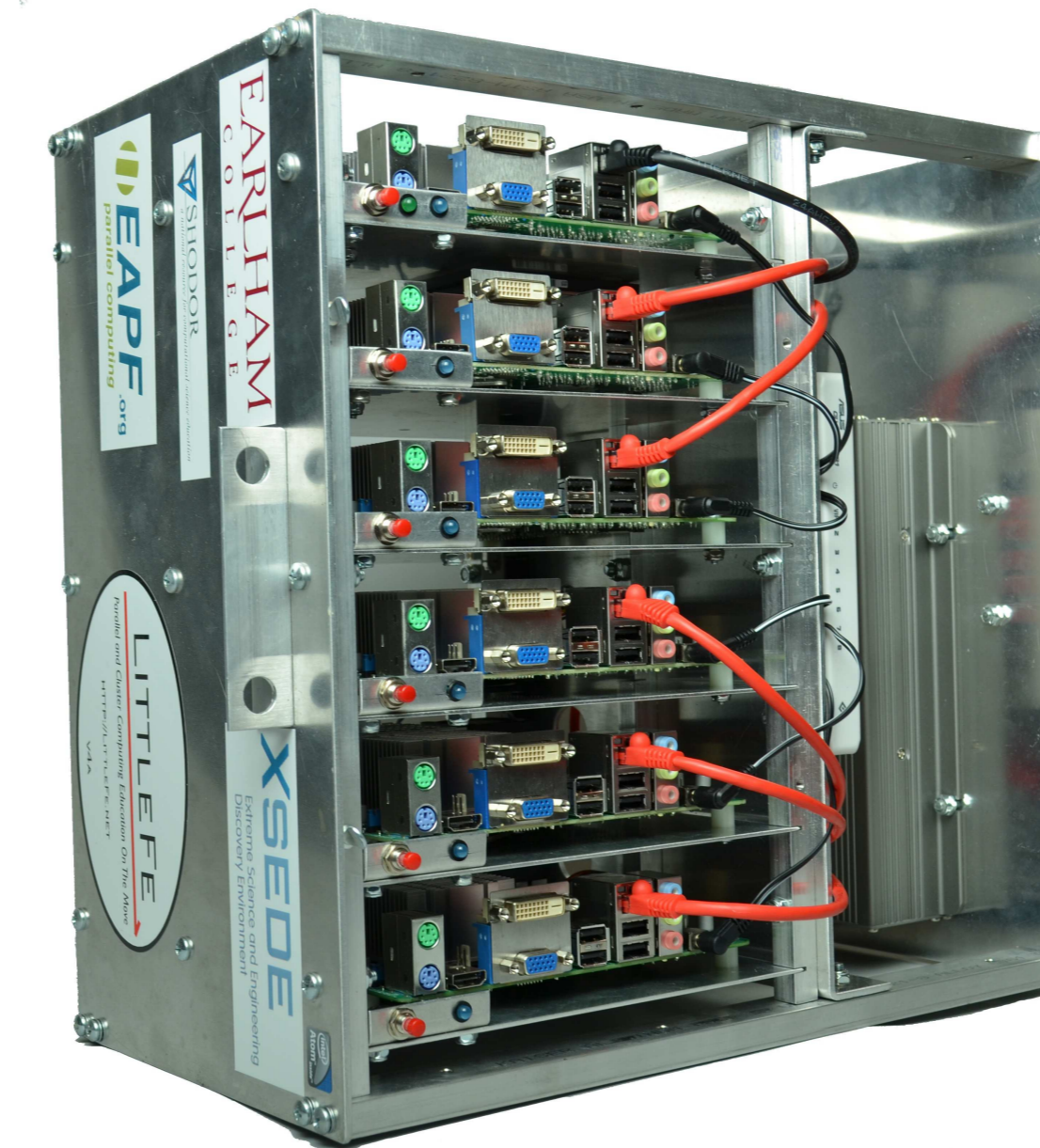
Figure 2: LittleFe v4b unit