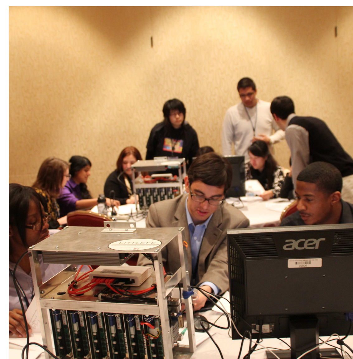
Figure 3: LittleFe in action, Tapia13

In comparison to personal laptops, which are not similar to production HPC clusters, or remote cluster resources, which are not hands-on and are susceptible to local infrastructure problems, LittleFe allows students to see and feel the physical structure of the cluster resource that they use to solve the computational science problems. This adds a hands-on element that piques the students' interests in learning more about HPC beyond the contests.